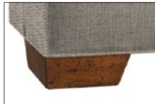
B - MEDIUM BLOCK FOOT 5" W x 2" H