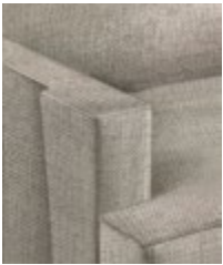
A - AVERY T CUSHION #AT - 7.5"