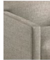
G - GUILDFORD SQUARE CUSHION #GA - 3"