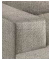
D - DAVIDSON T CUSHION #DT - 10"