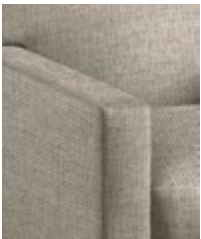
H - HEYDON SQUARE CUSHION #HA - 4"