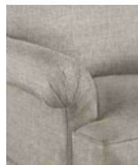
L - LEYLAND T CUSHION #LT - 7.5"