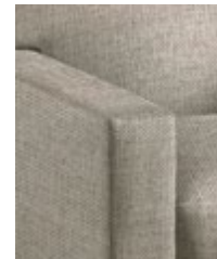
J - JENSEN SQUARE CUSHION #JA - 5"