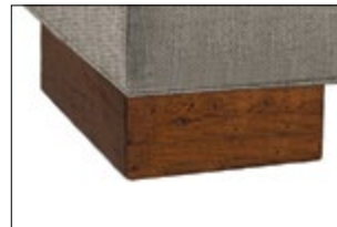
L - LARGE BLOCK FOOT 7-1/2" W x 2" H