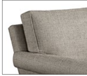
B - BOXED BACK PILLOW