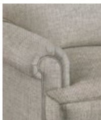
N - NORWICH T CUSHION #NT - 7.5"

When selecting arm styles A, D, G & H the back pillow will reside within the arms. If you want the back pillow to extend over the arm please specify.