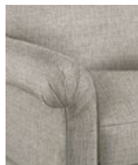
L - LEYLAND SQUARE CUSHION #LA - 7.5"