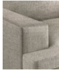
I - INMAN T CUSHION #IT - 7.5"