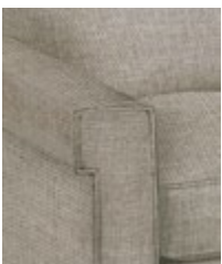
K - KERSEY SQUARE CUSHION #KA - 5.5"