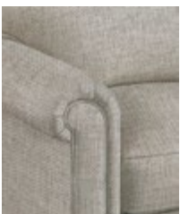
N - NORWICH SQUARE CUSHION #NA - 7.5"