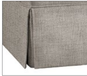
K - KICK PLEAT FLOUNCE BASE