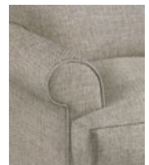
M - MARGATE T CUSHION #MT - 7.5"