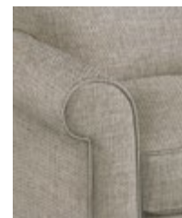
M - MARGATE SQUARE CUSHION #MA - 7.5"