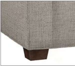
E - EXPOSED LEG BASE