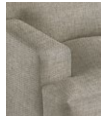
J - JENSEN T CUSHION #JT - 5"