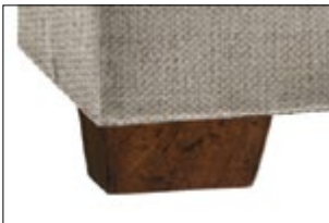
A - SMALL BLOCK FOOT 4" W x 2" H