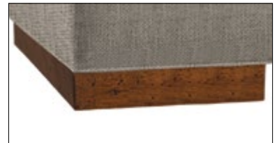
N - EXTRA LARGE BLOCK FOOT 10" W x 2" H