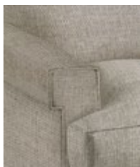
K - KERSEY T CUSHION #KT - 5.5"