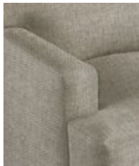
H - HEYDON T CUSHION #HT - 4"