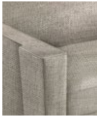
A - AVERY SQUARE CUSHION #AA - 5.5"