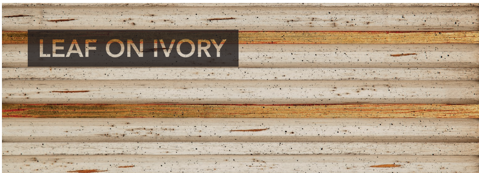
LEAF ON IVORY